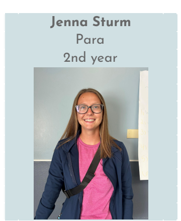
Sumner County Education Services Interlocal 619 strives to enable students to reach their full potentional, develop real life skills, and to make positive choices after graduation through collaboration among educators, parents, students, and community.