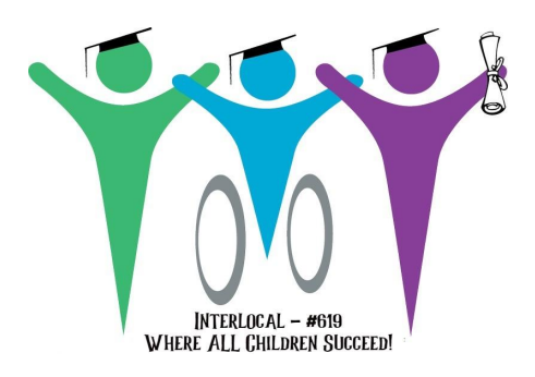
Summer County Education Services Interlocal 619 strives to enable students to reach their full potentional, develop real life skills, and to make positive choices after graduation through collaboration among educators, parents, students, and community.